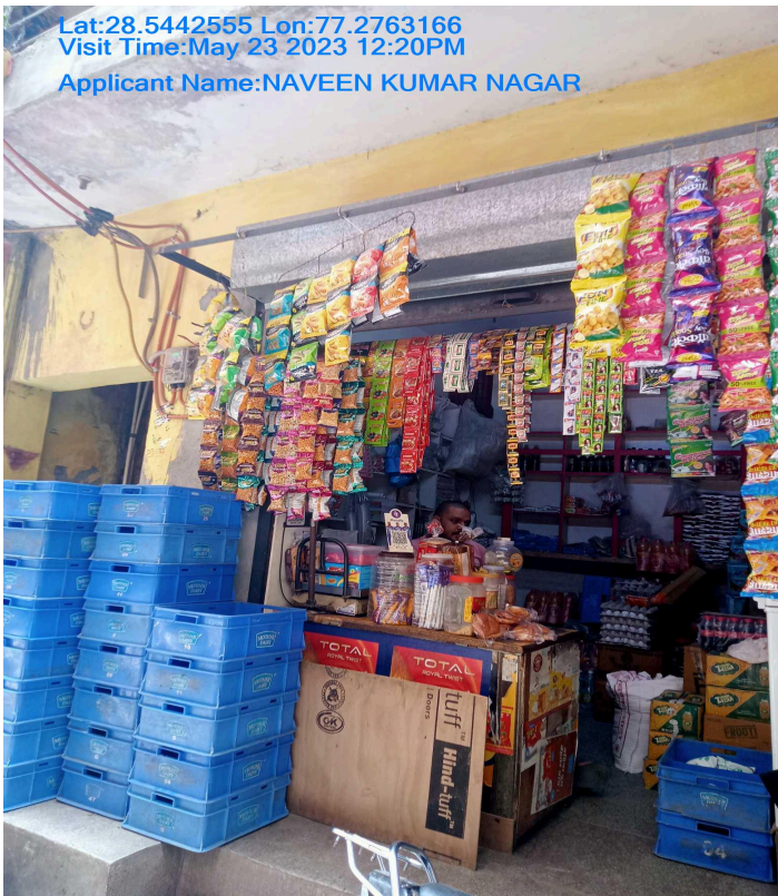
Visit Type: OV